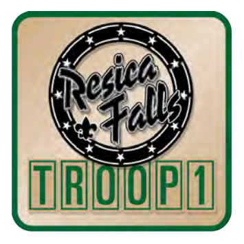
Resica Falls Scout Reservation